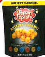
Family Size Resealable Bag