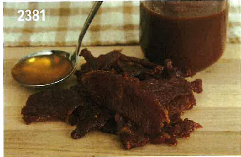
2381 Honey BBQ Beef Jerky $18 Beef Jerky smothered in sweet honey & BBQ sauce for a delicious snack! 3 oz.