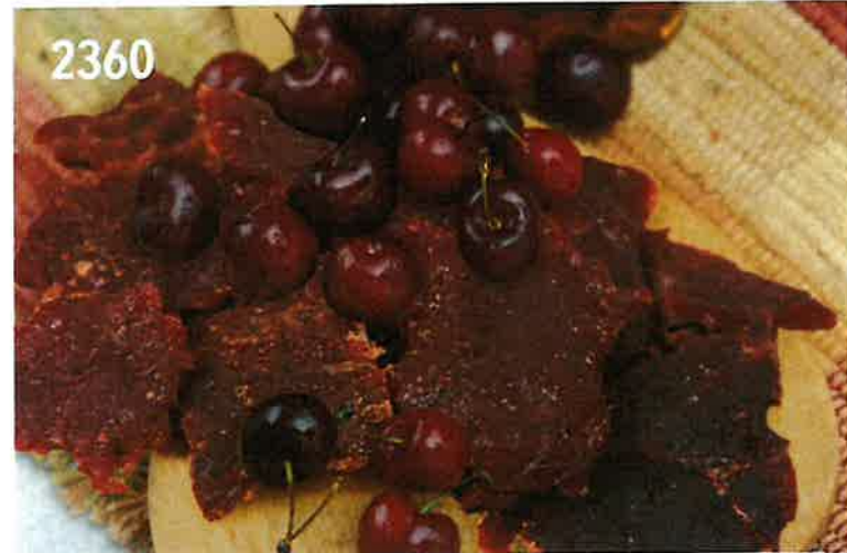
2360 Cherry Maple Turkey $18 The best tasting jerky you will ever buy. Tender cuts of turkey, with a maple cherry flavor. 3 oz.