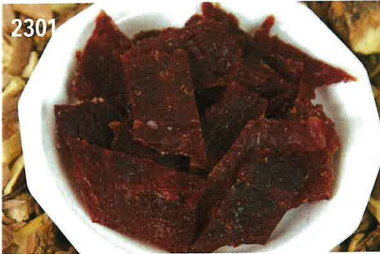
2301 Original Beef Jerky $18 The tender smoked beef in our blend of original spices is the perfect snack! 3 oz.