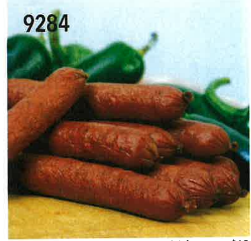
9284 Hot-N-Spicy Hunter Sticks $18 Our original, great, homemade blend of pork with a lil' extra zing! 5 oz.