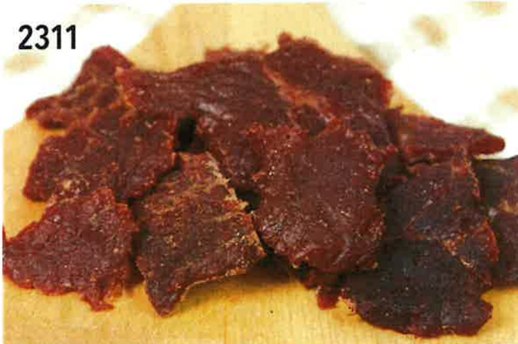
2311 Teriyaki Beef Jerky $18 Sweet and tasty! Our smoked teriyaki flavored jerky uses only the best cuts of beef! 3 oz.