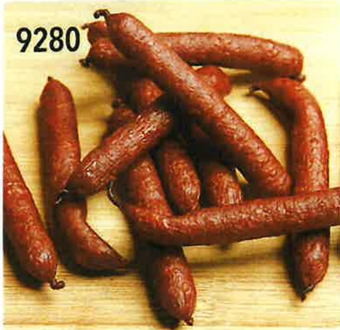
9280 Original Hunter Sticks $18 Pork mixed in our original blend of spices for this amazing snack! 5 oz.