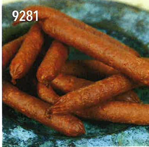
9281 Teriyaki Hunter Sticks $18 A special blend of pork and homemade spices with teriyaki flavor. 5 oz.